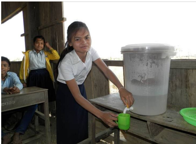
Water filter use