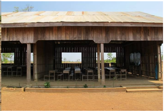
D - Site photographs of your educational activities (at least 3 pictures)