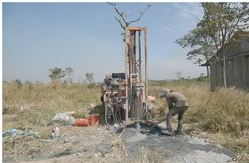
Building the water pump